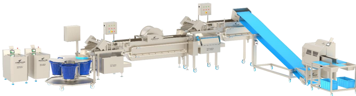
HS-FLEX in a vegetable processing line for cutting, washing and drying vegetables