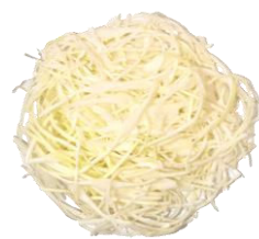
White Cabbage 3 mm