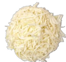
White Cabbage 20 x 3 mm