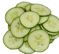
Cucumber 3 mm