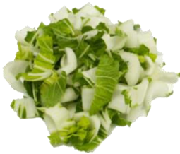
Pak Choi 10 x 20 mm

With this knife vegetables as leek (half rings), iceberg lettuce (dice), white cabbage (short threads) and melon (dice for fruit-salad) can be cut in length and cross-section in one time. The length can easily be adjusted on the touch screen. The width size is available in every multiple size of 5 mm.