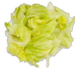
Iceberg Lettuce 35 x 35 mm