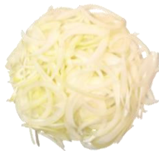
Onion Rings 3 mm

With this disc all kinds of cabbages (trails), beet (slices), onion rings, potatoes and other round products can be cut perfectly. The adjustable disc can be used in combination with the standard wing knife and with the wing knife with cross cut knives.