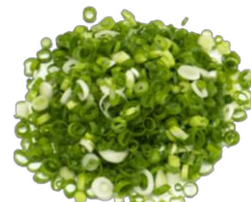
Spring Onion 3 mm