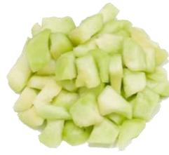
Melon 20 x 25 mm