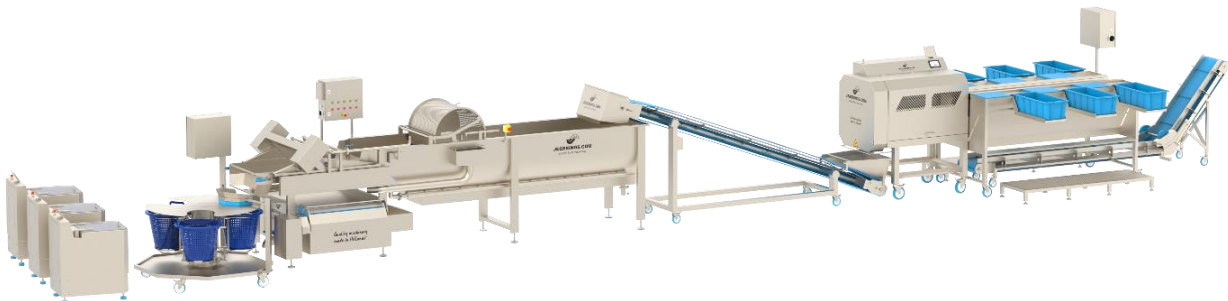
BCM-3000 in a vegetable processing line for cutting, washing and drying vegetables

The BCM-1650 can also be seamlessly integrated in a vegetable processing line for cutting, washing and drying vegetables. Similarly as with the BCM-1650, the entire processing line is well-suited to process a wide variety of vegetables. The exact configuration of the machinery and accessories of this processing line will be dependent on the processing requirements of the client.