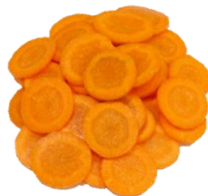
Carrots 3 mm

With this disc large quantities of white and red cabbage can be sliced. Also products such as cucumber, carrots, potatoes and onions can be cut into slices. To your choice a cut size of 1,5 - 2 - 3 or 4 mm.