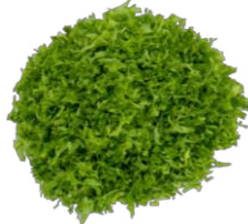
Parsley 2 mm