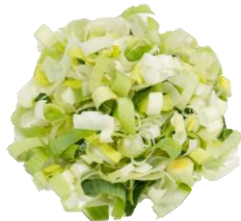
Leek 12 x 25 mm