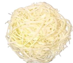
White Cabbage 3 mm