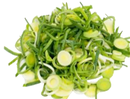
Leek 4 mm