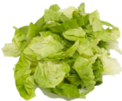
Lettuce 20 mm

This knife is perfectly suited for all kinds of leafy vegetables such as salads, endive, chicory, celery, spring onion, Chinese cabbage, oxheart cabbage, flat string beans etc. can be cut perfectly. Also herbs such chives, parsley and chili peppers are cut perfectly regular, even in very small cutting sizes. With this knife you can cut any cutting size between 1 - 55 mm which can easily be adjusted on the touchscreen of the BCM-3000.